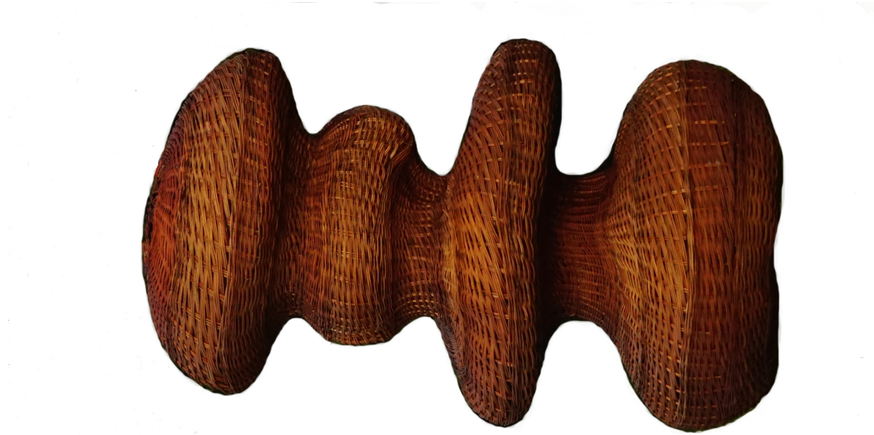
Pulsating wicker structure horizontally - visualization of the weave, texture and one of the possible colors of the body of the planned sculpture.

In a way, it would be also an allegorical reminder. If we do not stop the process of global warming soon, camels, a rather unusual sight in the northern forest, will feel at home here (while in the regions of the earth closer to the equator, no species living there until now will be able to survive due to deadly heat).